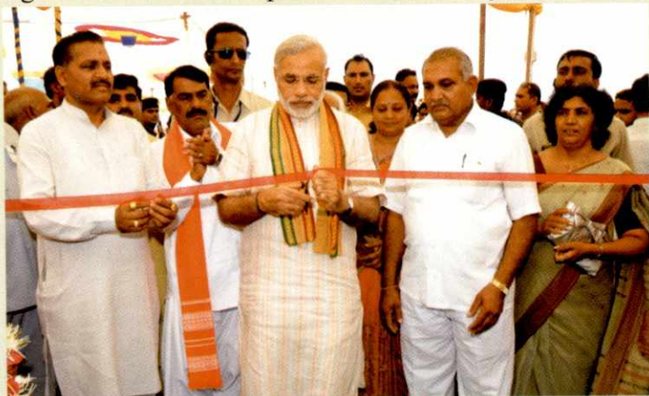
Hon'ble Chief Minister Shri Narendrabhai Modi inaugurating the mega krushi mela

The Mega Krushi Mela was organized during 24 to 26 th May, 2009 under the aegis of Krushi Mahotsav, 2009. The whole programme was composed of 3-day krushi mela, one national seminar on Fruit and Vegetable Processing and Export, nine seminars on different topics and four different exhibitions related to the agricultural technologies viz. (i) Fruit & Vegetable Processed Products Exhibition & Competition (ii) Exhibition of Gujarat Agro Industries Corporation Ltd. (iii) GGRC & (iv) Macro & Micro Irrigation systems. The Mega Krushi Mela was inaugurated by Hon'ble Chief Minister Shri Narendrabhai Modi in presence of Shri Dilipbhai Sanghani, Hon'ble Minister of Agriculture and Cooperation, Shri Vajubhai Vala,