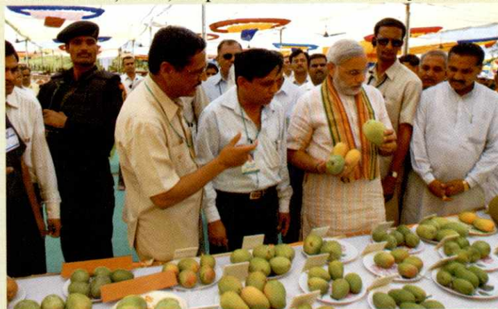
Hon'ble Chief Minister Shri Narendrabhai Modi observing the Mango Exhibition.

The Exhibition was organized jointly by Dept. of Horticulture, JAU, Dept. of Horticulture, Gujarat state,